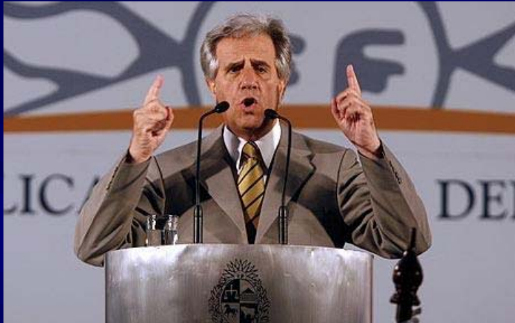
Tabaré Vázquez, MD (2005-2010)